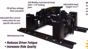
Fit all four air bags from one point